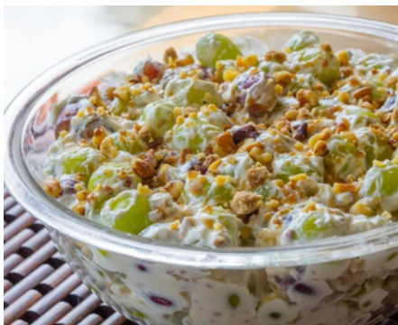
Trisha Yearwood Creamy Grape Salad Recipe (Trish is married to Garth Brooks)