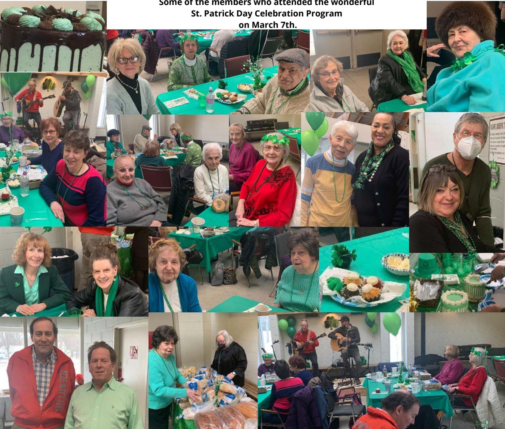
Some of the members who attended the wonderful St. Patrick Day Celebration Program on March 7th.